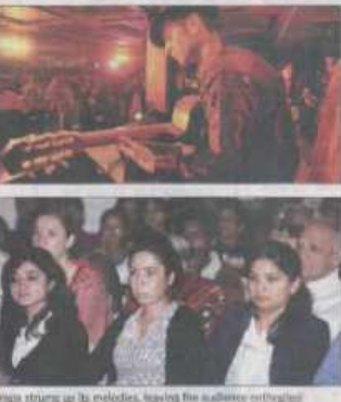
Yapa turns up its volleys, leaving the audience entranced