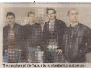
The members of Yapa, a band of jazzists and percussionists from France, arrive.