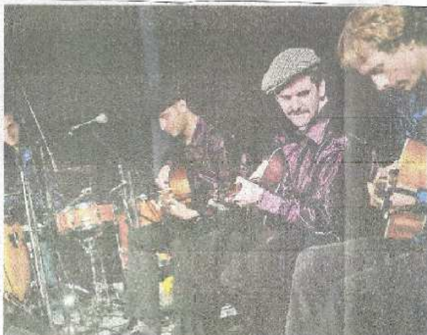
STANDING BOWIE WITH THEIR WIGGED FINGERS.

The band's performance was a real success story, and they have a strong sense of rhythm and melody. The music was a blend of different styles, and they have a strong sense of rhythm and melody.